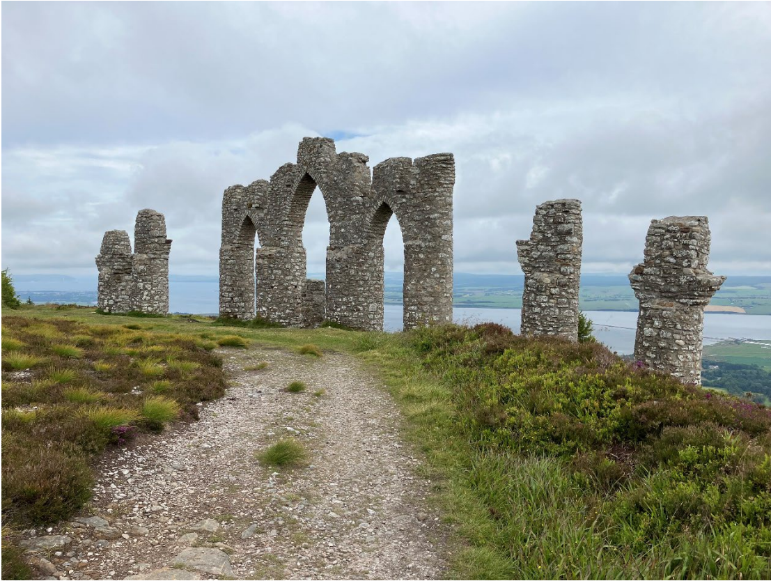
Plate 11 Fyrish Monument, looking towards the Site, which is obscured by topography