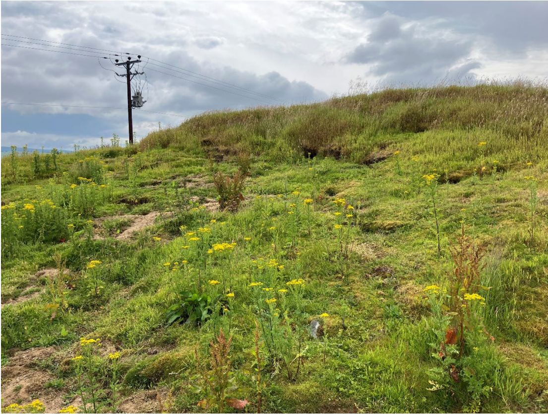
Plate 5 Knoll, showing rabbit burrows and shallow soil profile