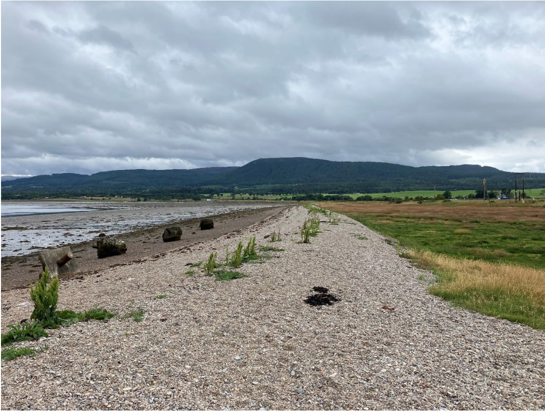
Plate 13 Looking towards the Site (largely obscured by trees) from Alness Bay. Fyrish Monument visible on skyline beyond.