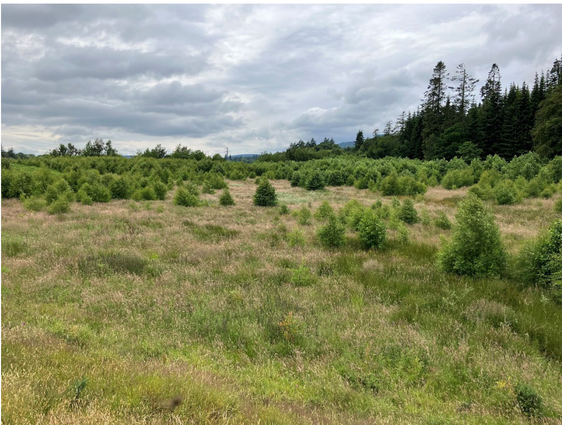
Plate 4 Western corner of Site, looking towards Novar GDL