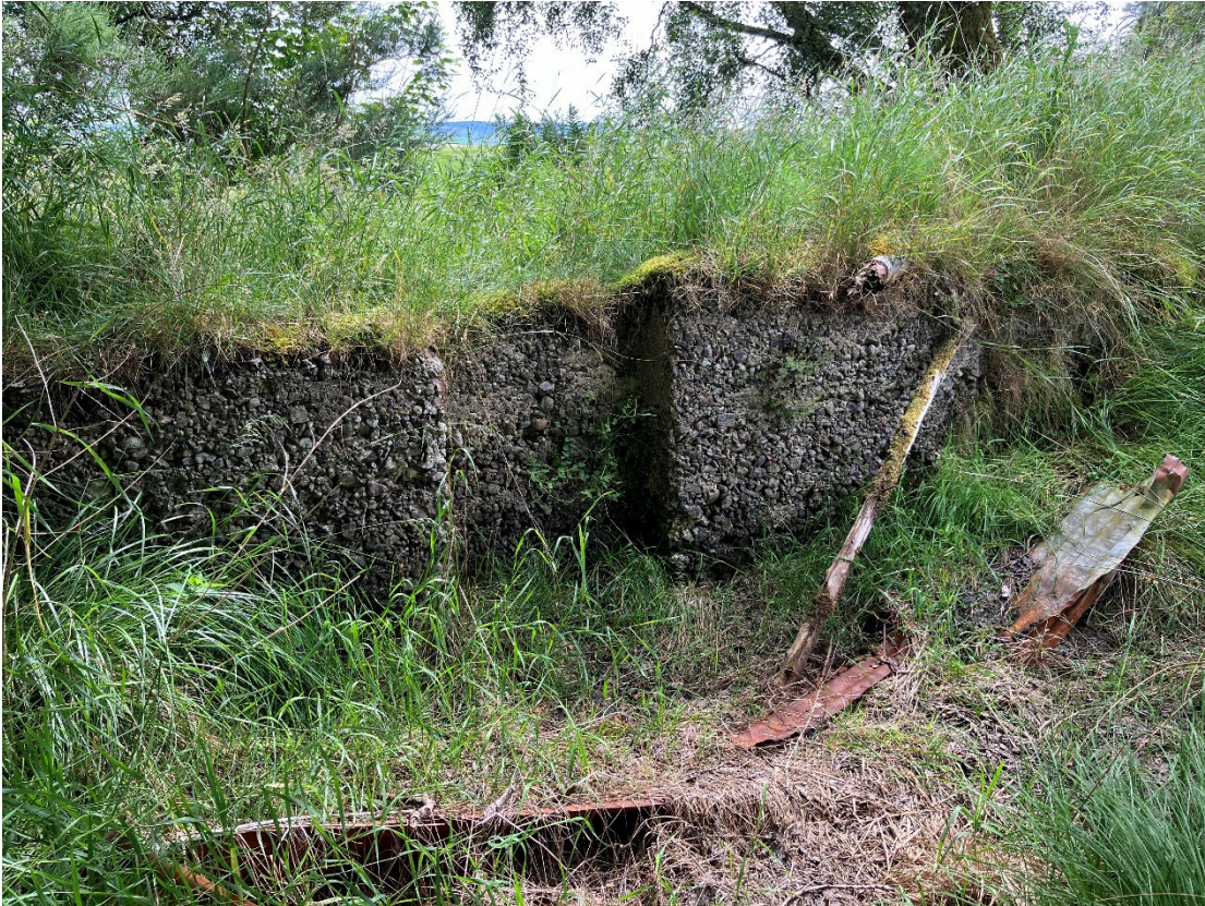
Plate 3 Blocked sluice gate