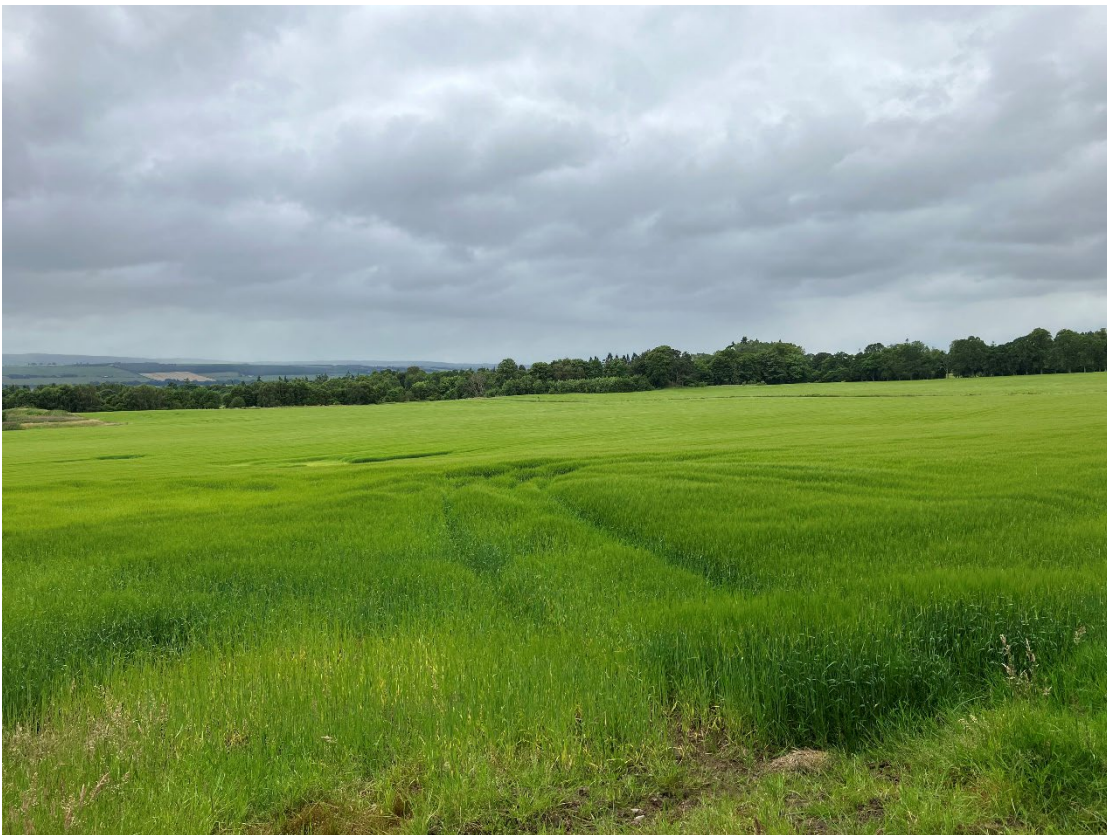
Plate 10 View south-west from Novar eastern drive, illustrating screening effect of woodland along the western drive