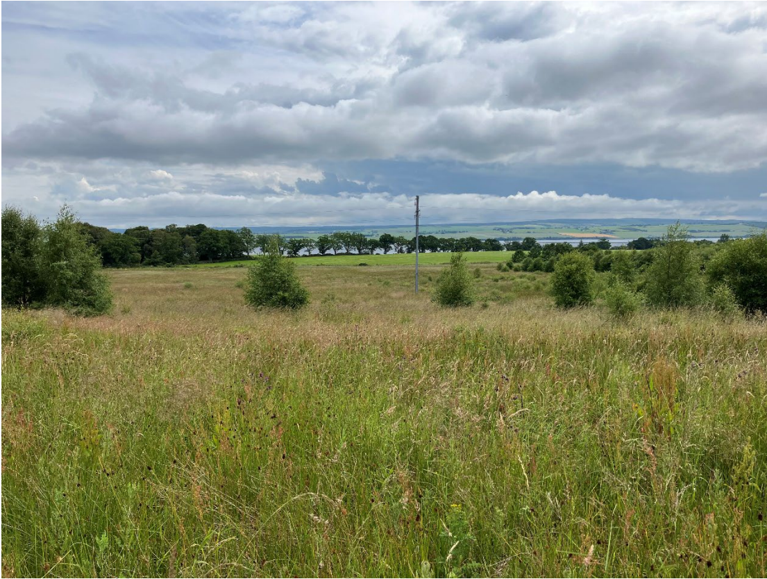
Plate 7 View south-east from the Site to the Cromarty Firth and Black Isle