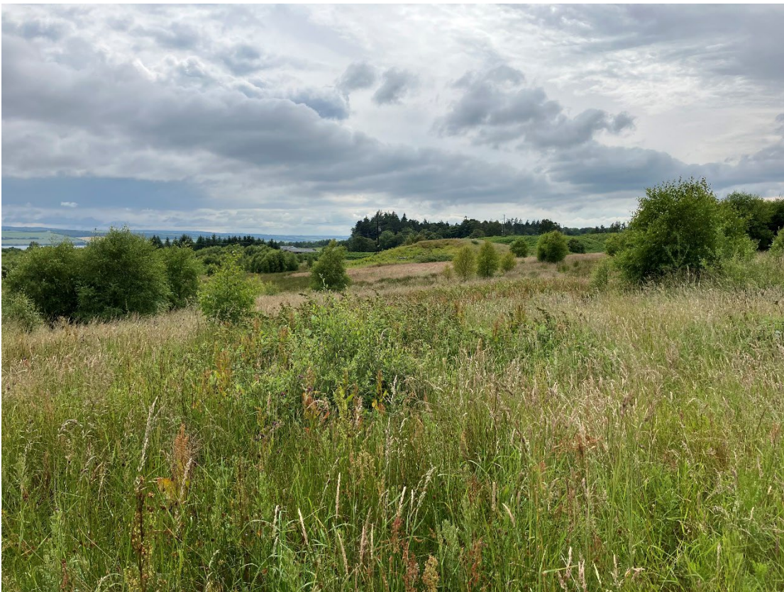
Plate 6 Looking south-west across the Site