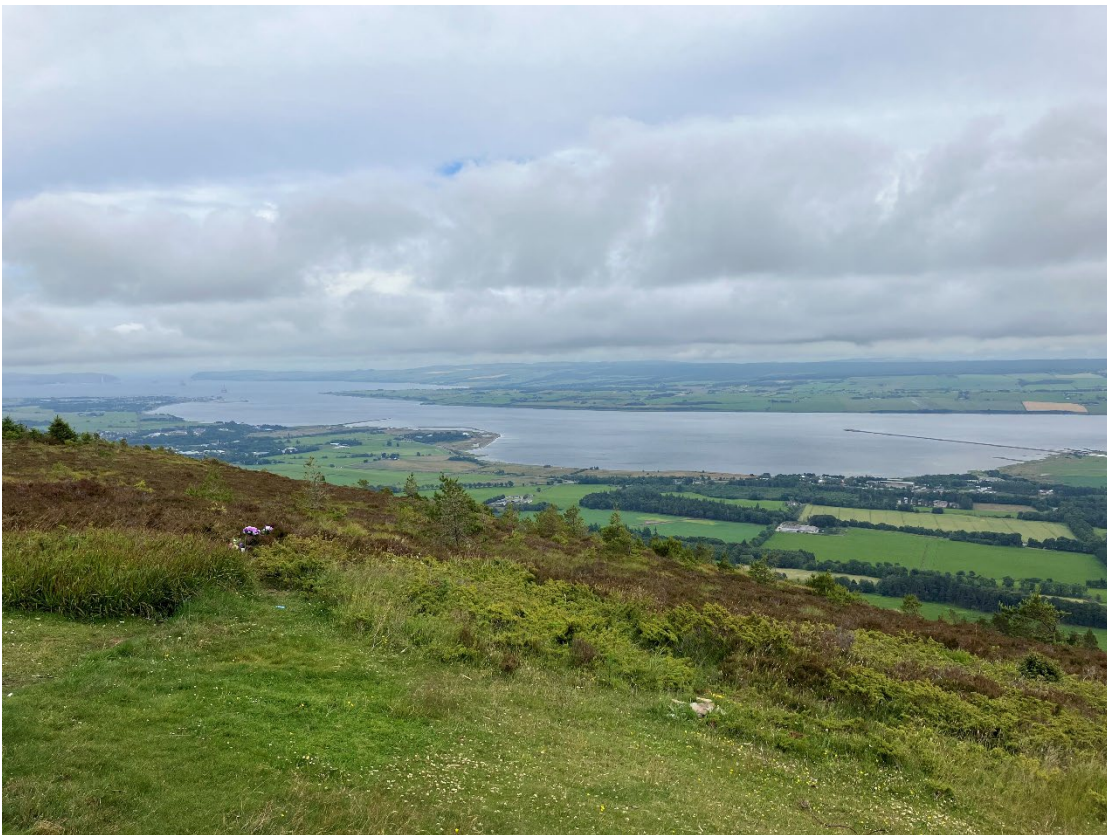
Plate 12 View from Fyrish Monument

Clashnabuaic and the southern corner of the Site are visible (centre)