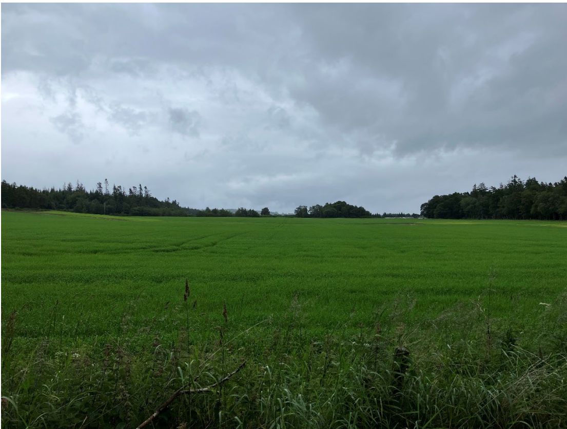
Plate 8 View towards Site (centre) from Novar eastern drive, at the eastern limit of the GDL