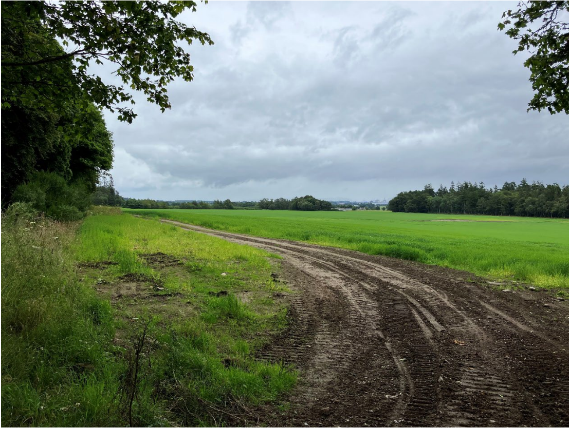
Plate 9 View towards Site (centre) from Novar eastern drive, at the eastern limit of the GDL